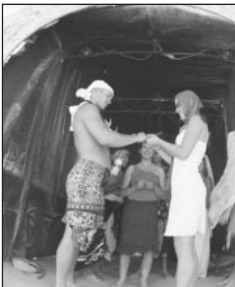
THEY DID A Santa Cruz couple ties the knot.

That definition of "freedom" is what will draw about 26,000 people to Burning Man this year. They come from all over the world to live in an environment without luxuries, but with lots of libido. It's a place without showers (unless they're handmade), free of lipstick, and a place where your body hair can get shaved by someone else, and what remains of your pubic hair can get crafted into a piece of walking "art" on your body. It's not uncommon to see nudity, in fact, nearly everyone who chatted with GT shared that they don't get "turned on" by the naked folks. Instead, they seem to view it as the absolute state of freedom. So what's so tantalizing about getting naked among a herd of strangers?