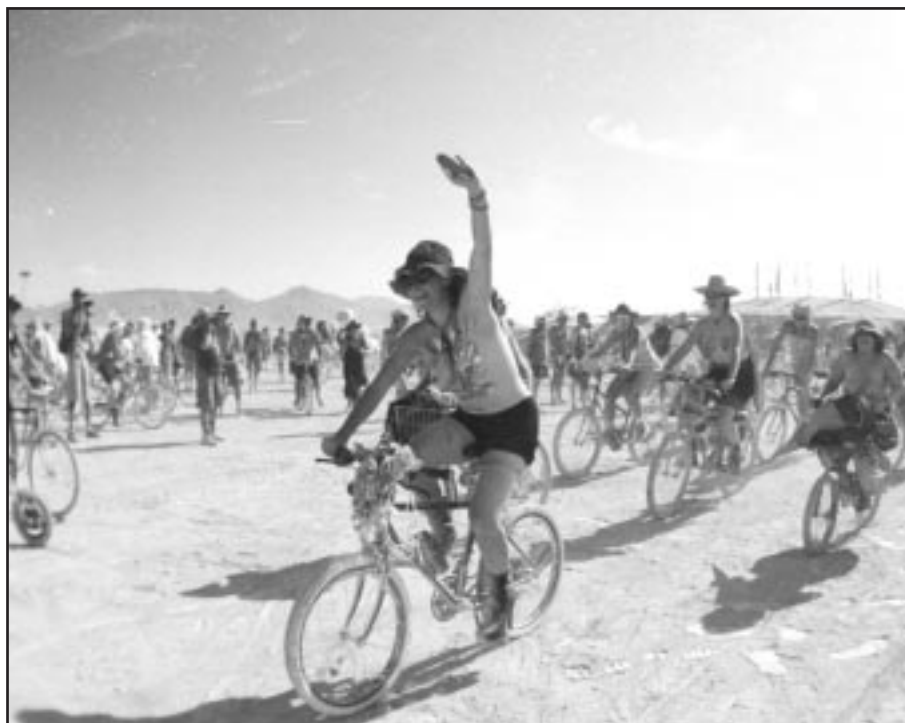
BOOB JOBS The all-women topless bike ride is a trek in self expression.

“Costco realized it had nothing ... by harassing us,” Modes