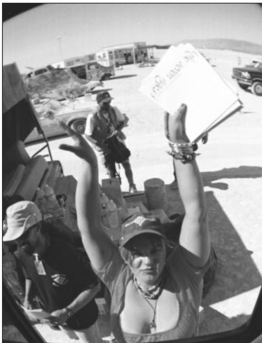
ON YOUR MARK ... "Burners" are greeted at the entrance of Black Rock City.

Back to the vision: Laurie was staring at the bus and basically, saw a suped up version of what he is now creating. It looked like a submarine out of Artisan Entertainment's feature film version