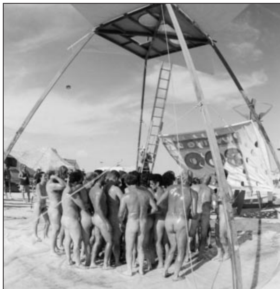
MESHED FLESH In one of many gatherings, a group of "Burners" celebrate life au naturel.

It's Black Rock City or bust as county residents partake in an annual pilgrimage to the Nevada desert and its most provocative event—Burning Man