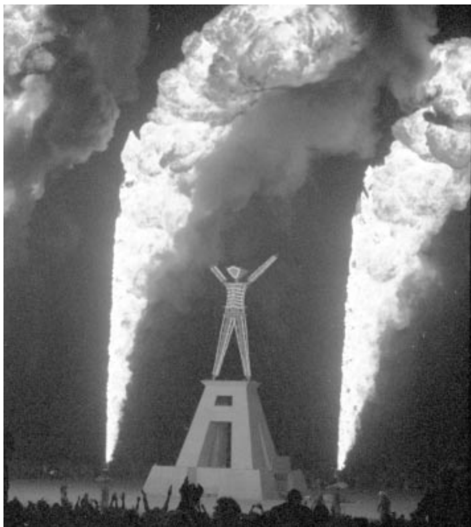
WHAT'S IN A FLAME? Crowds gather to burn the "Man" at the event's finale.

And that brings up the main theme—the fascination with fire. On the last night, a Saturday, a giant man constructed of wood, is burned. Around him, on the ground, revelers watch the man disinte-